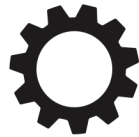
Machining & Electronics