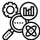
Research & Design