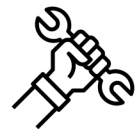
Test & Repair