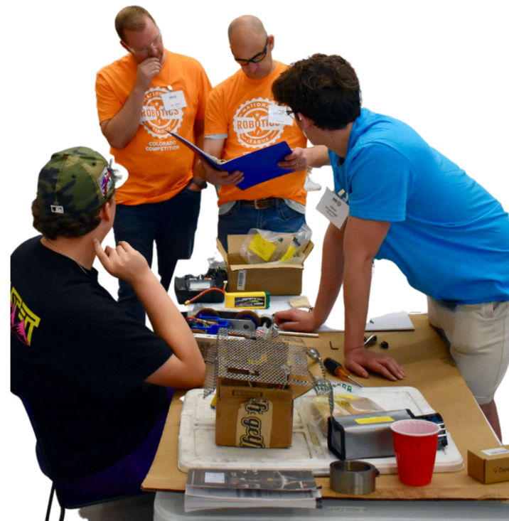
Photo to the right is from the 2022 NRL Colorado Competition of Industry Advisors reviewing students' binder.